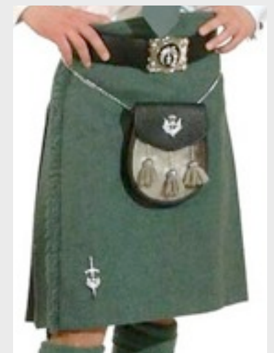
Lovat Green Tweed