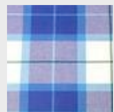
Wallace Blue Dress

There are a couple of recurring versions of these: Dress and Hunting tartans. These are distinct variants, based on similar themes but with different thread counts (which makes them a different tartan). Hunting tartans tend to have more greens or other earth tones. Dress tartans have more