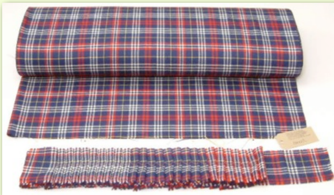
Tartan showing the sett, and three arrangements 'to stripe'. Note: the pleats here are loosely folded, not pressed as on a kilt.

The great majority of kilts are made with what is called pleating 'to sett'. This simply means folding the fabric in a way that replicates and continues the tartan's natural pattern all the way around the garment when the folds are lying flat. This is what most people prefer .