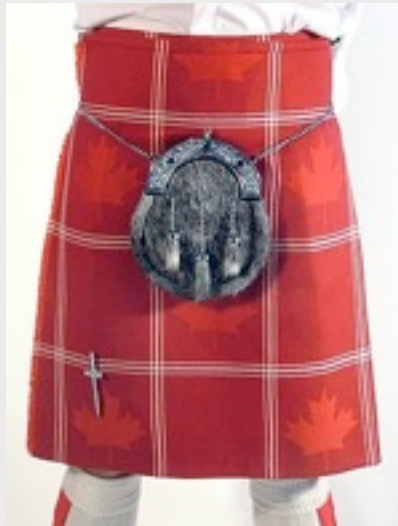
Canadian Maple Leaf Emblem

A popular choice, particularly cut as casual kilts for